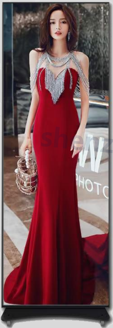
Floor stand with wheels